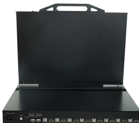
▲ Back view